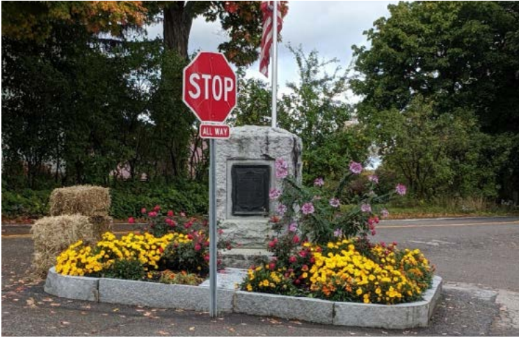
Charlotte World War I Memorial