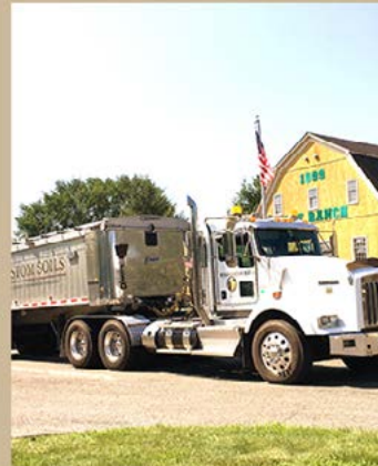
ATHLETIC FIELD AND GOLF COURSE MATERIALS

BIORETENTION SOILS • FIBER SOILS • ROOTZONES • STABILIZED STONEDUST CU STRUCTURAL SOIL • INFIELD MIX • GREEN ROOF MEDIA