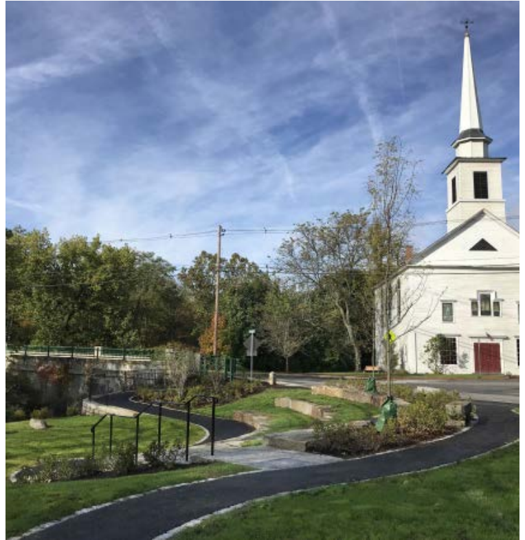
Saxtons River Park