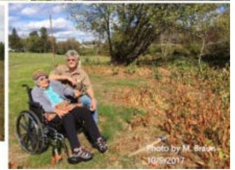
Dog River Park