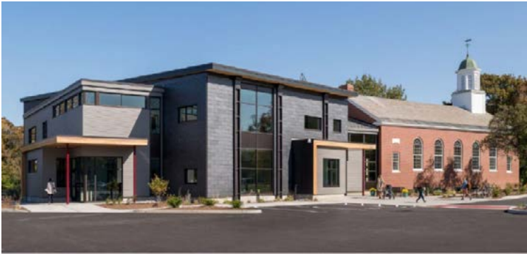
Shelburne Pierson Library and Historic Town Hall