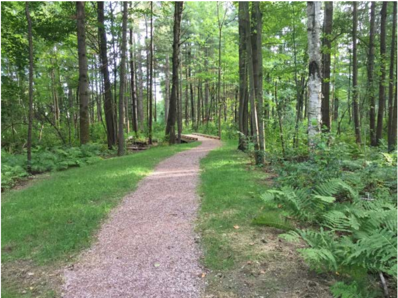
City Center Park

Developed for the Town of Fairlee by a team led by DuBois & King