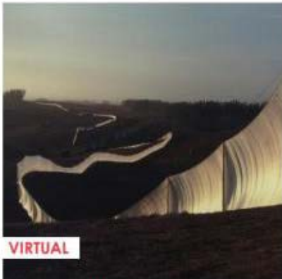
Running Fence Dec. 8 – 10, 2021