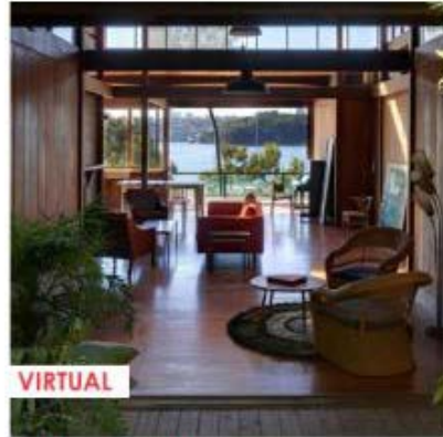
Richard Lepastrier: Framing the View Oct. 27 – 29, 2021