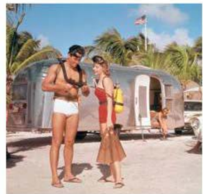
Alumination Apr. 13, 2022