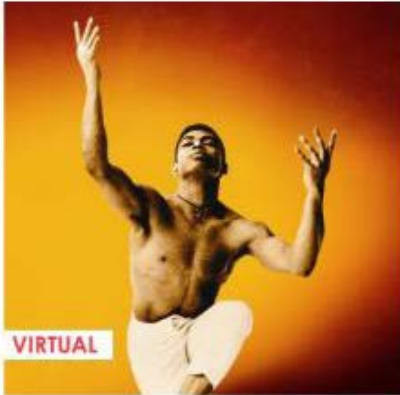
Ailey Sept. 29 – Oct. 1, 2021

The films are released monthly on Wednesdays and run from September through April. The format has been changed to allow the films to be screened from home. See www.adfilmseries.org for more information, the full schedule and description of films, and to stream the current film.