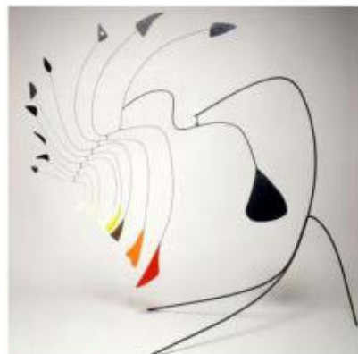
Alexander Calder Mar. 16, 2022