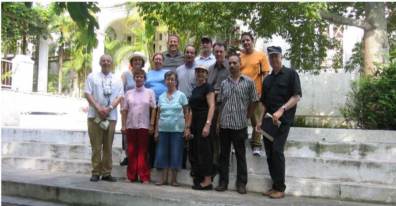
Finca Vigia, showing the National Trust and Cuba Culture Ministry team for Ernest Hemingway's 25 acre property, in Havana, Cuba.

The National Trust for Historic Preservation, a privately funded nonprofit organization, works to save America's historic places to enrich our future. SavingPlaces.org