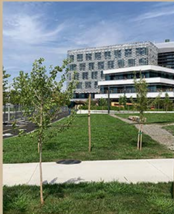
ENGINEERED SOILS HARVARD CAMPUS