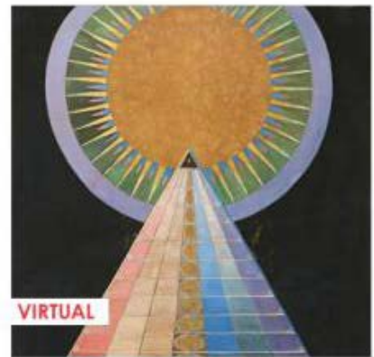
Beyond the Visual Hilma af Klint Nov. 17 – 19, 2021