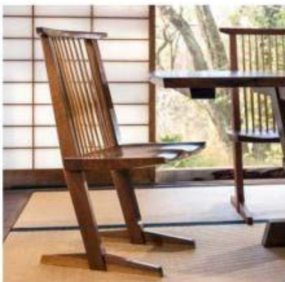
George Nakashima: Woodworker Feb. 16, 2022