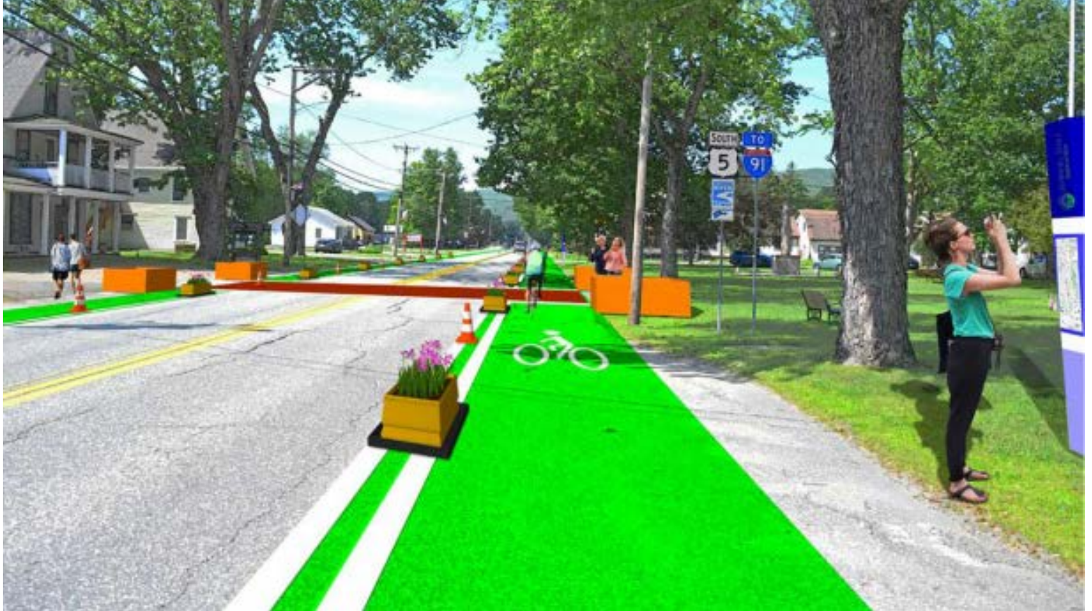
Farlee Village Center Action Plan