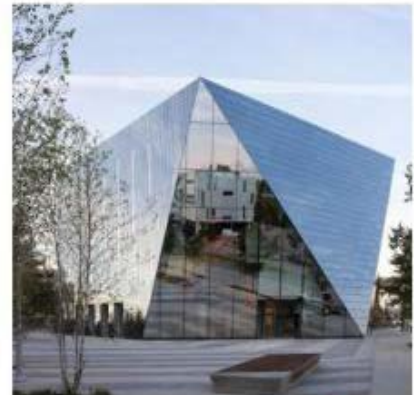
Making Space: 5 Women Changing the Face of Architecture Jan. 19, 2022

2022 dates, at this time, are expected to be in-person