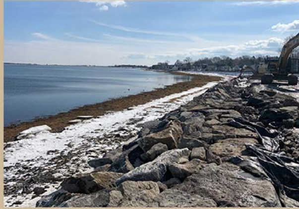
BEACH NOURISHMENT SOLUTIONS NEWBURYPORT BEACH