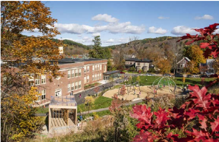
Union Elementary School Playground Project