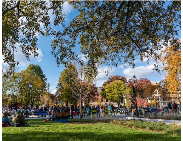
Burlington City Hall Park Restoration