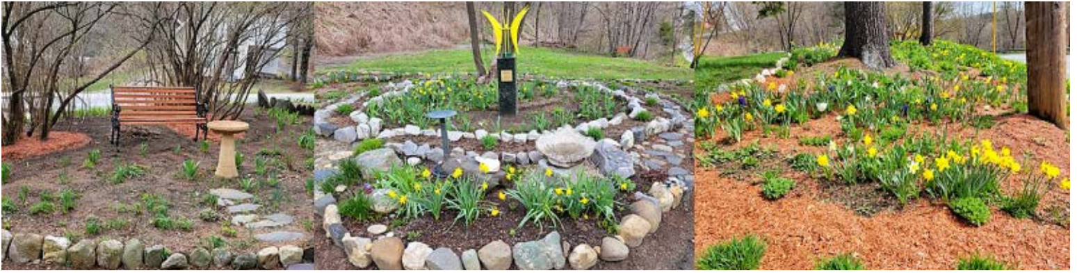
Elm Street Park, Randolph