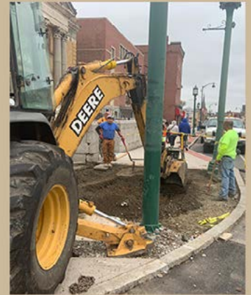
CU STRUCTURAL SOIL® MAIN STREET USA