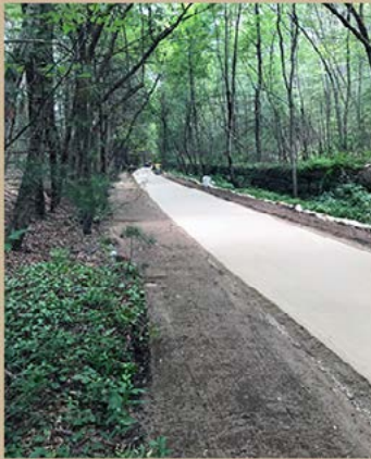
STABILIZED STONEDUST® TRUNKLINE TRAIL