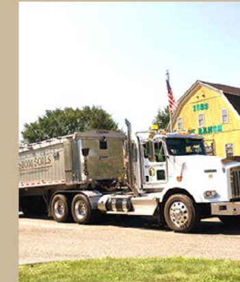
ATHLETIC FIELD AND GOLF COURSE MATERIALS

BIORETENTION SOILS • FIBER SOILS • ROOTZONES • STABILIZED STONEDUST CU STRUCTURAL SOIL • INFIELD MIX • GREEN ROOF MEDIA