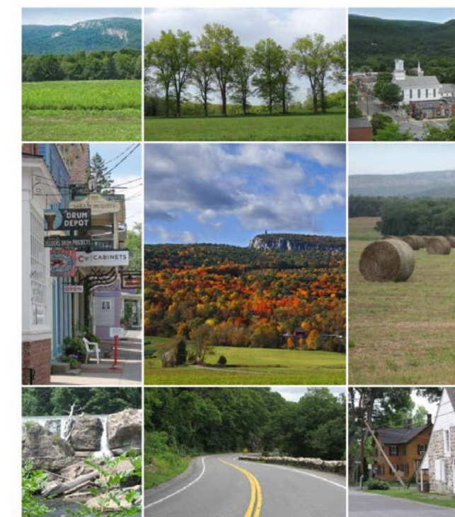
Scenic Resources in the Shawangunk Mountains Region - A Guide for Planning Boards