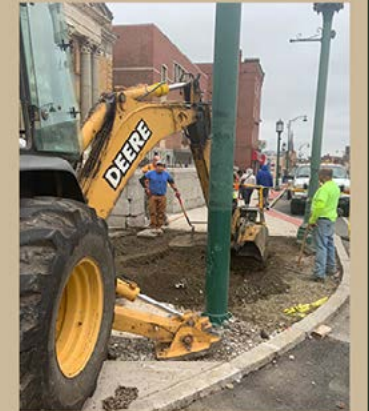
CU STRUCTURAL SOIL® MAIN STREET USA