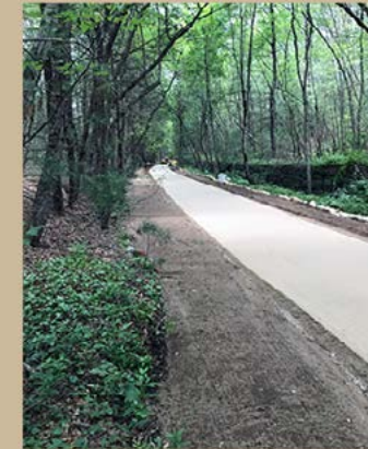
STABILIZED STONEDUST® TRUNKLINE TRAIL