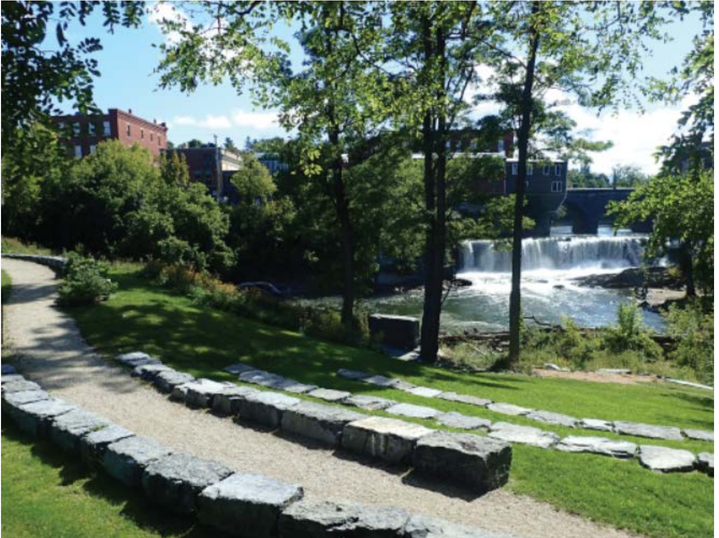
Middlebury Riverfront Park - Landworks Design