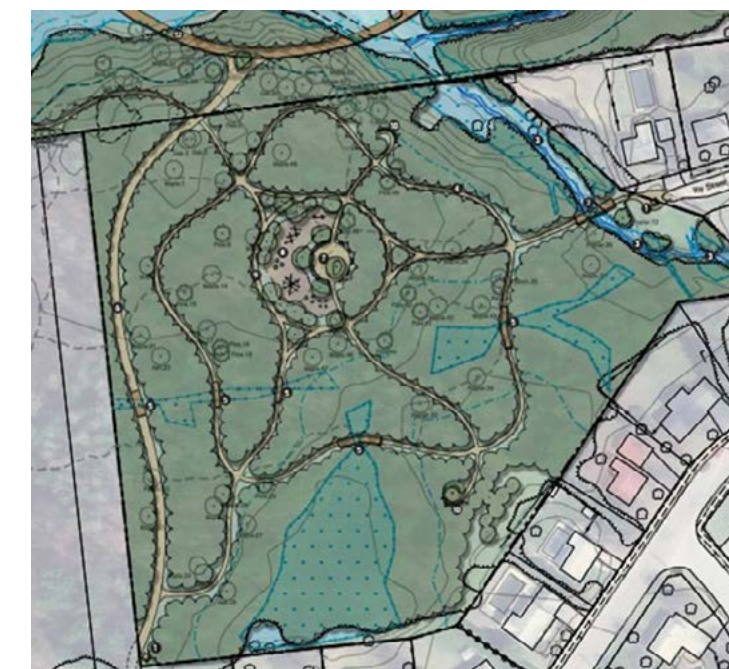
City Center Park