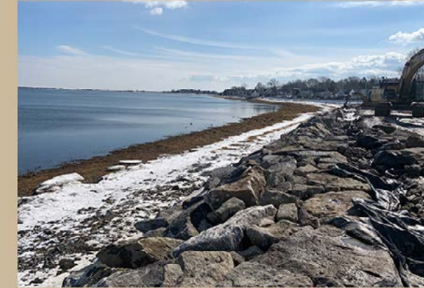
BEACH NOURISHMENT SOLUTIONS NEWBURYPORT BEACH