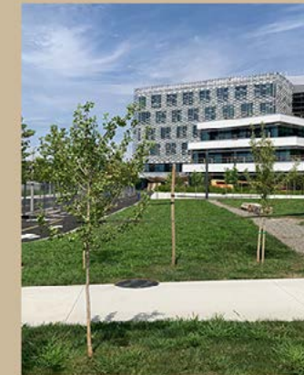
ENGINEERED SOILS HARVARD CAMPUS