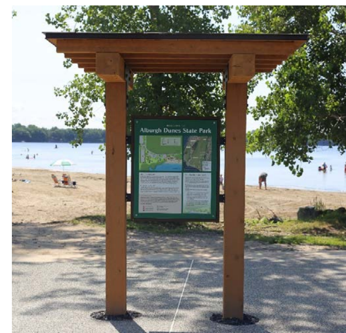
Alburgh Dunes State Park