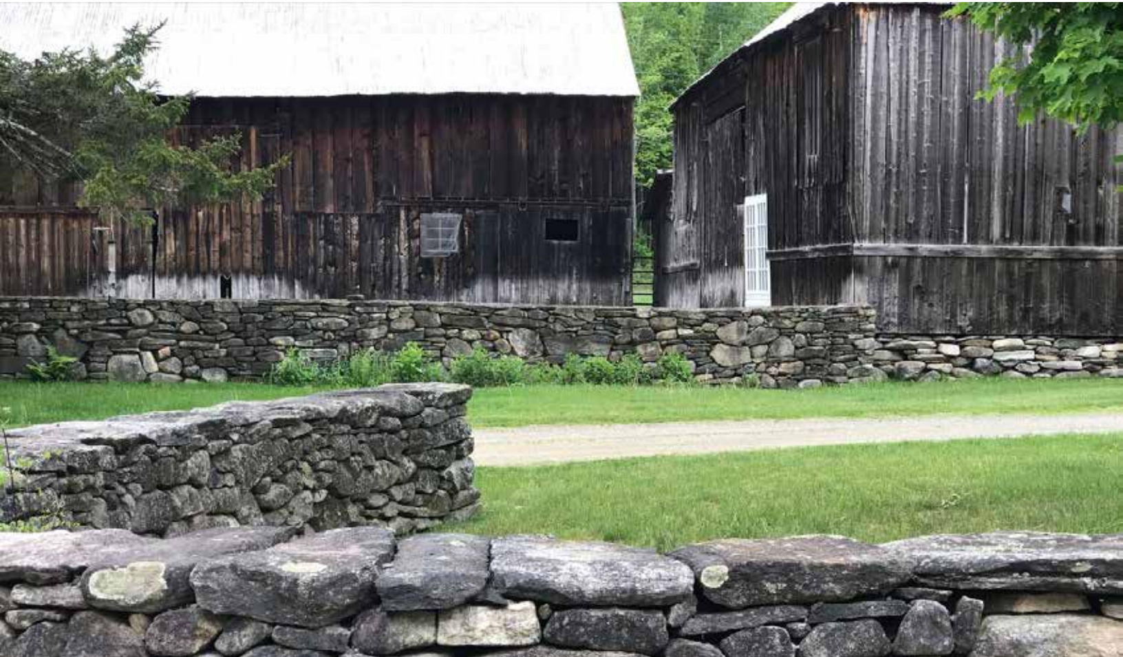
Historic Chester Farm- Terrigenous