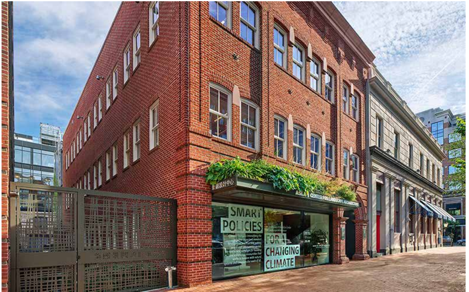
The ASLA Center for Landscape Architecture on Eye Street NW in Washington, D.C. features a green roof on both the ground level entry and building roof.

Additionally, ASLA's office asset includes a rooftop skylight, which distributes natural light and reduces the use of artificial lighting. The property received LEED 2009 Commercial Interiors Platinum certification in April 2019 with 83 points on the scorecard and has been Energy Star certified for many years"