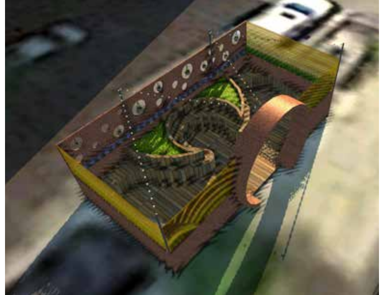
Beau Doucette's PARKing day concept featuring multiple seating pods.

In Vermont, Beau Doucette and Reif Larsen submitted 3d renderings that explored some creative ideas for how to create more outdoor park space right downtown. What do you think?