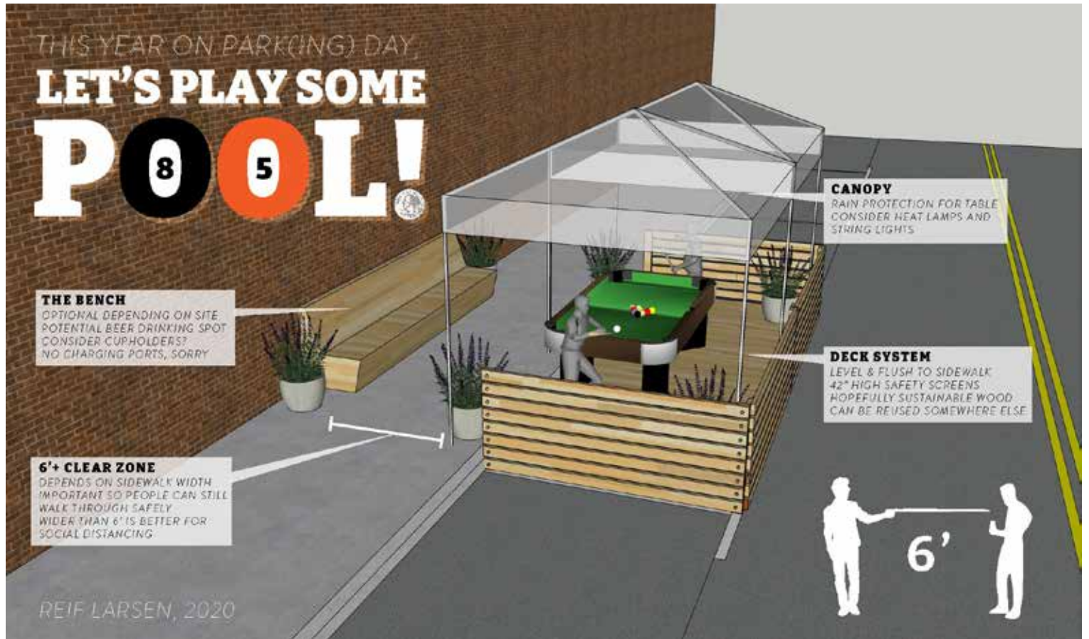
Reif Larsen submitted this outdoor take on pool- complete with regulation socially distant pool cue.